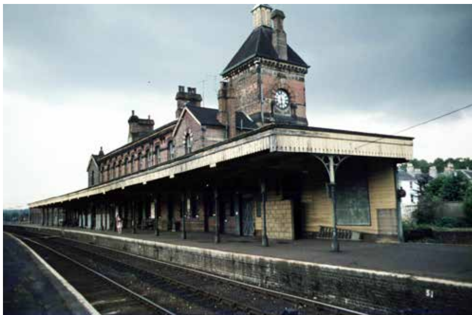
Tunbridge Wells West 1970s