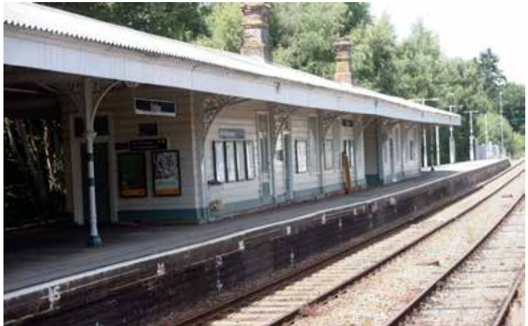
Eridge Station 2013

1880 platform buildings, and the fine cast ironwork in the Southern Railway colours of cream and green providing a splendid backdrop to the trains after their five and a half mile journey.