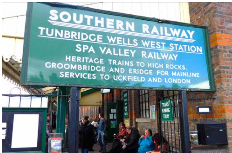
Tunbridge Wells West new station