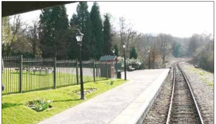
High Rocks Halt 2006

A motor train halt between Groombridge and Tunbridge Wells West had opened in 1907, for access to the High Rocks a popular spot for climbers. Constructed entirely of wood with staggered platforms either side of the road over-bridge, it closed in 1952. The present owner of the High Rocks Inn, a great supporter of the railway, constructed a new halt also named High Rocks. Situated west of the original it consists of a platform illuminated by some fine lamp posts, a hut and a gateway to his hotel; a restaurant and wedding venue. This opened in 1998 and is served by the preserved railway. More track clearance and sleeper replacement helped by Lottery funding opened the line to Birchden junction in 2005. This junction is where lines from Uckfield and Eridge, and Oxted and Ashurst meet the line from Groombridge.