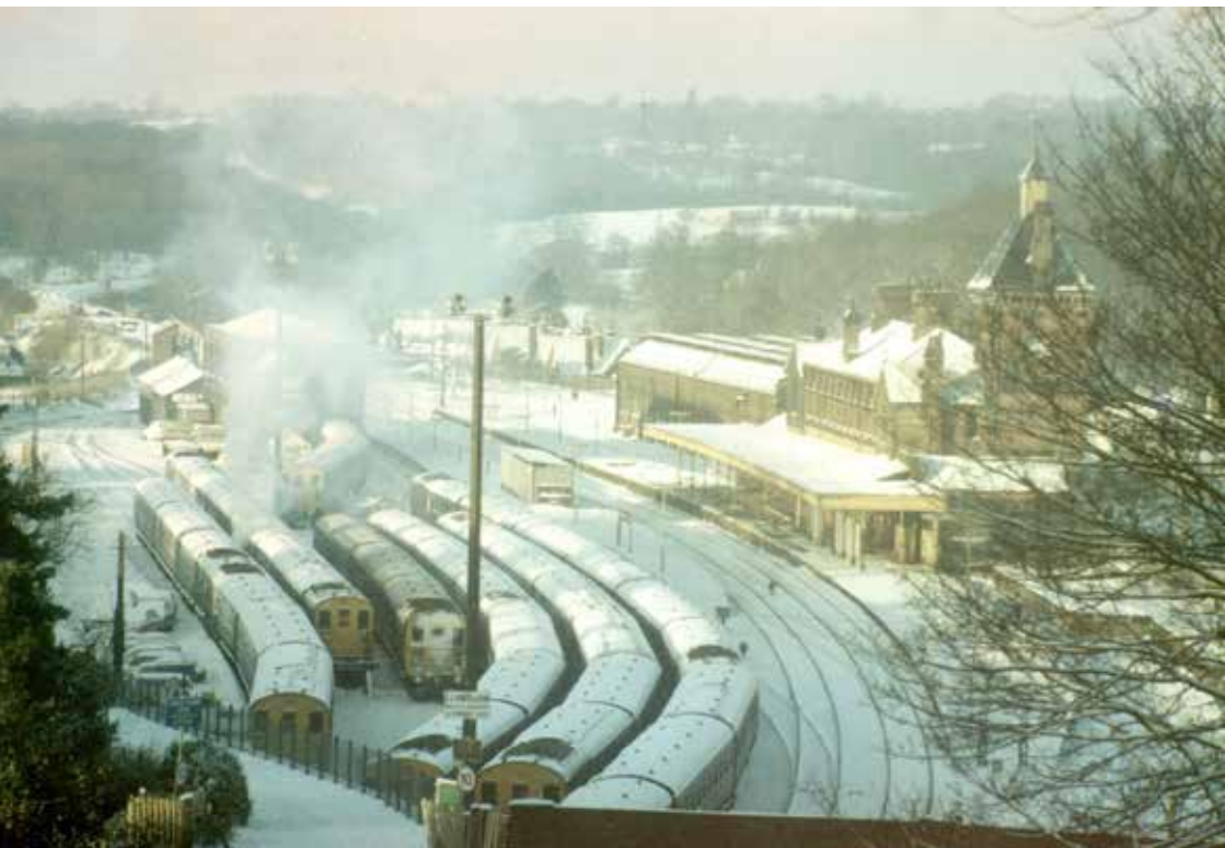
Tunbridge Wells West Station and berthing sidings Winter 1970s