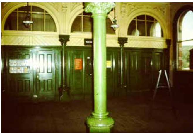
Tunbridge Wells West Booking Hall 1970s

A preservation society was formed straightaway whose aim was to reopen the line between Tunbridge Wells West and Eridge, The Tunbridge Wells aund Eridge Preservation Society (TWERPS). The site at Tunbridge Wells West consisted of the original 1866 station building where the booking office and the section under the canopy were illuminated by gas until closure. A subway leading to an island platform, both electrically lit, but where the canopy and platform buildings had been previously demolished. Other features included a two storey goods shed of 1866 (the only LB&SCR one with a hipped roof and its large goods yard which was latterly used for stabling DEMU's. A four road engine shed of