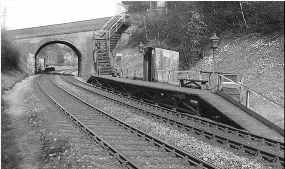
High Rocks halt, Spa Valley Railway 1950s

SERIAC 2026 is on Saturday 25 April - Please see details on page 8, be sure to book.