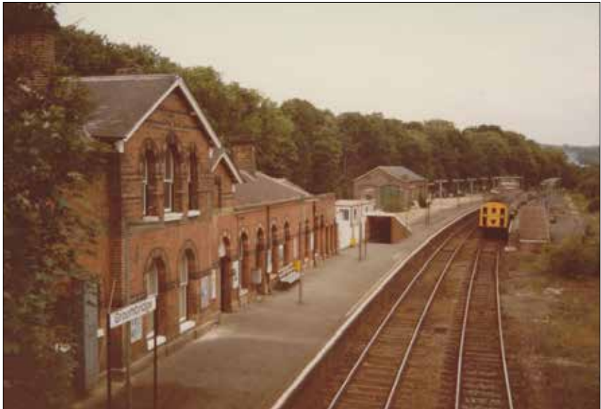
Groombridge Station 1980s