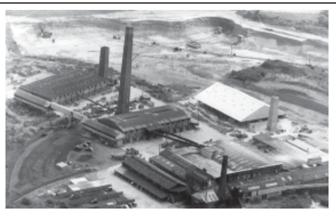
New IA Book for 2011

Additional copies of the booking form may be downloaded and printed from our website: - www.sussexias.co.uk