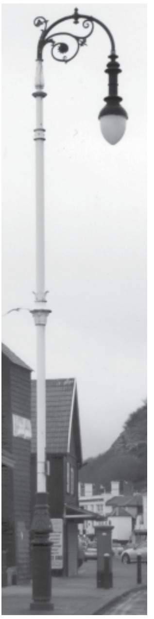
Lamp column, Hastings

(See Newsletter 122 April 2004 for a brief history of the ironworks. Ed)