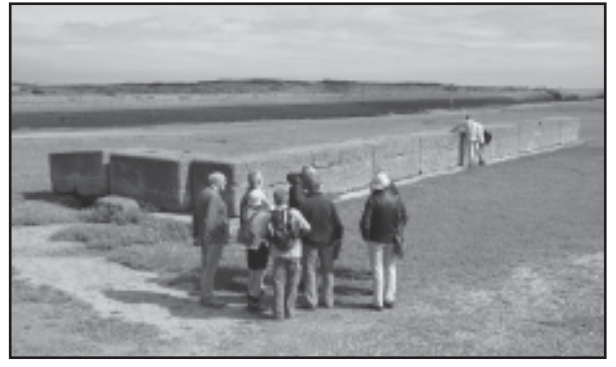
Remains of concrete blocks cast for the Dover Harbour breakwaters. As observed by members on Ron's recent visit to Rye Harbour. (Malcolm Dawes)

Finally, the wind farm feebly replacing two nuclear power stations.